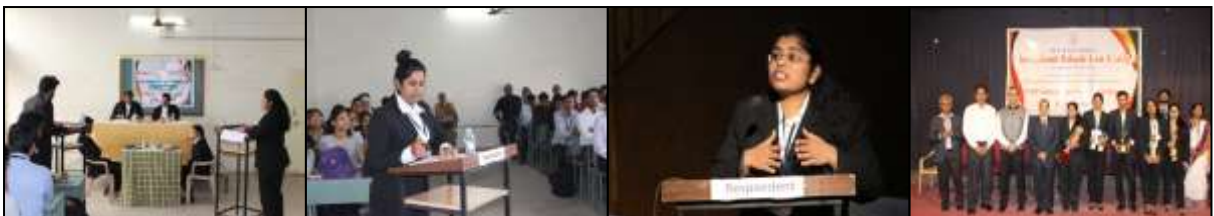
MPLC-XIX NATIONAL MOOT COURT COMPETITION- 2018